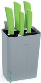
Knife block with plastic slats